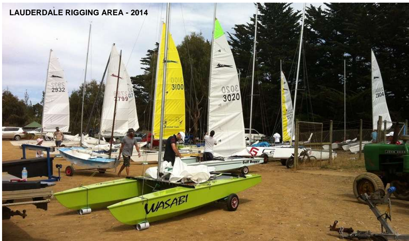
LAUDERDALE RIGGING AREA - 2014