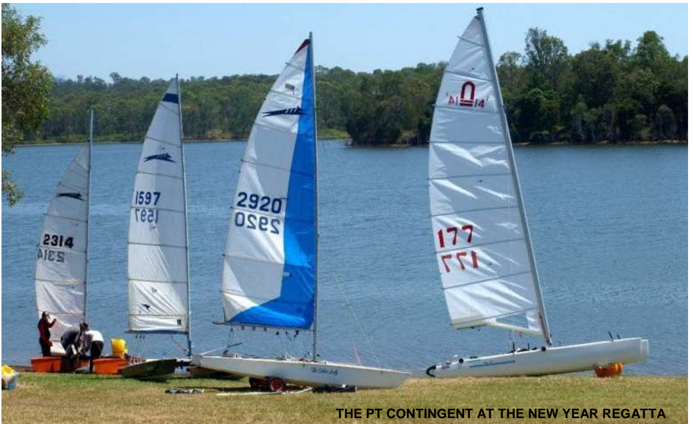
THE PT CONTINGENT AT THE NEW YEAR REGATTA