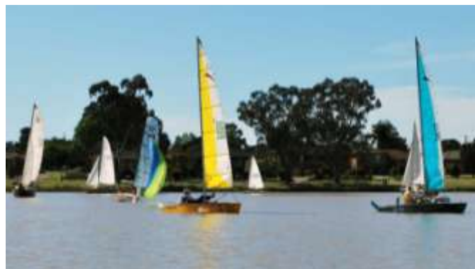
WAGGA WAGGA PRE-ALGAE